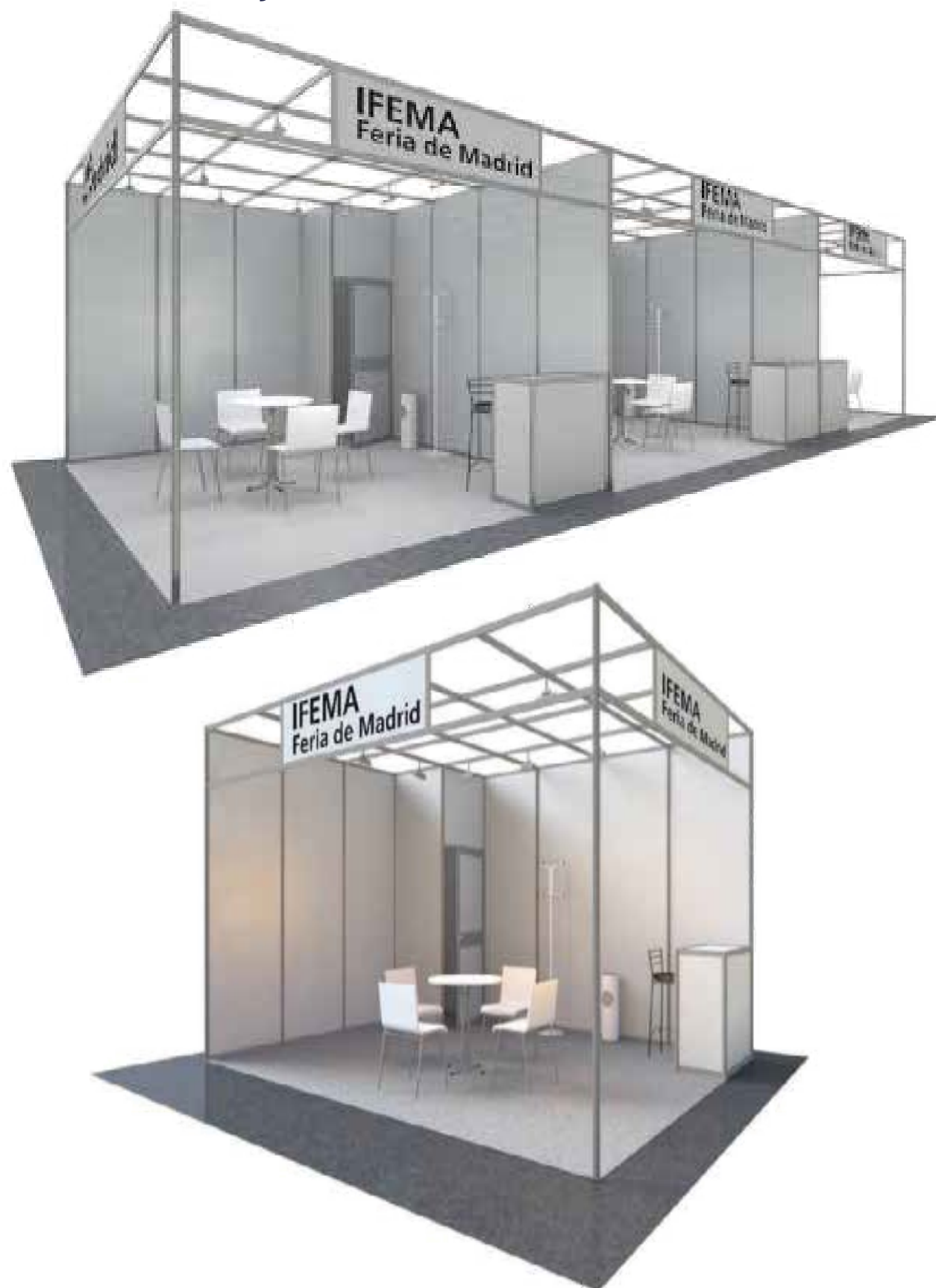
Turnkey "all-inclusive" stand Modular BASIC

GUIDING DRAWING: It is not allowed to pierce or nail elements to the stand. It is possible to use adhesive tape or graphics, which are easily removable and do not damage the panels.