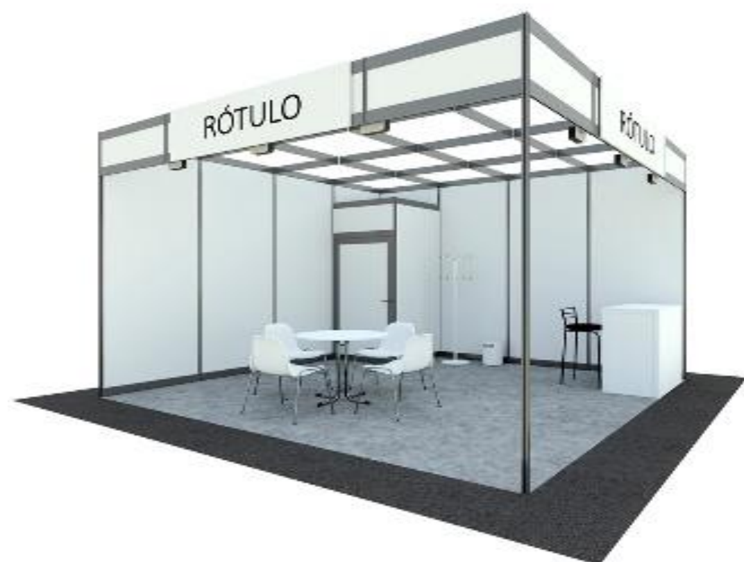
Turnkey "all-inclusive" stand Modular BASIC