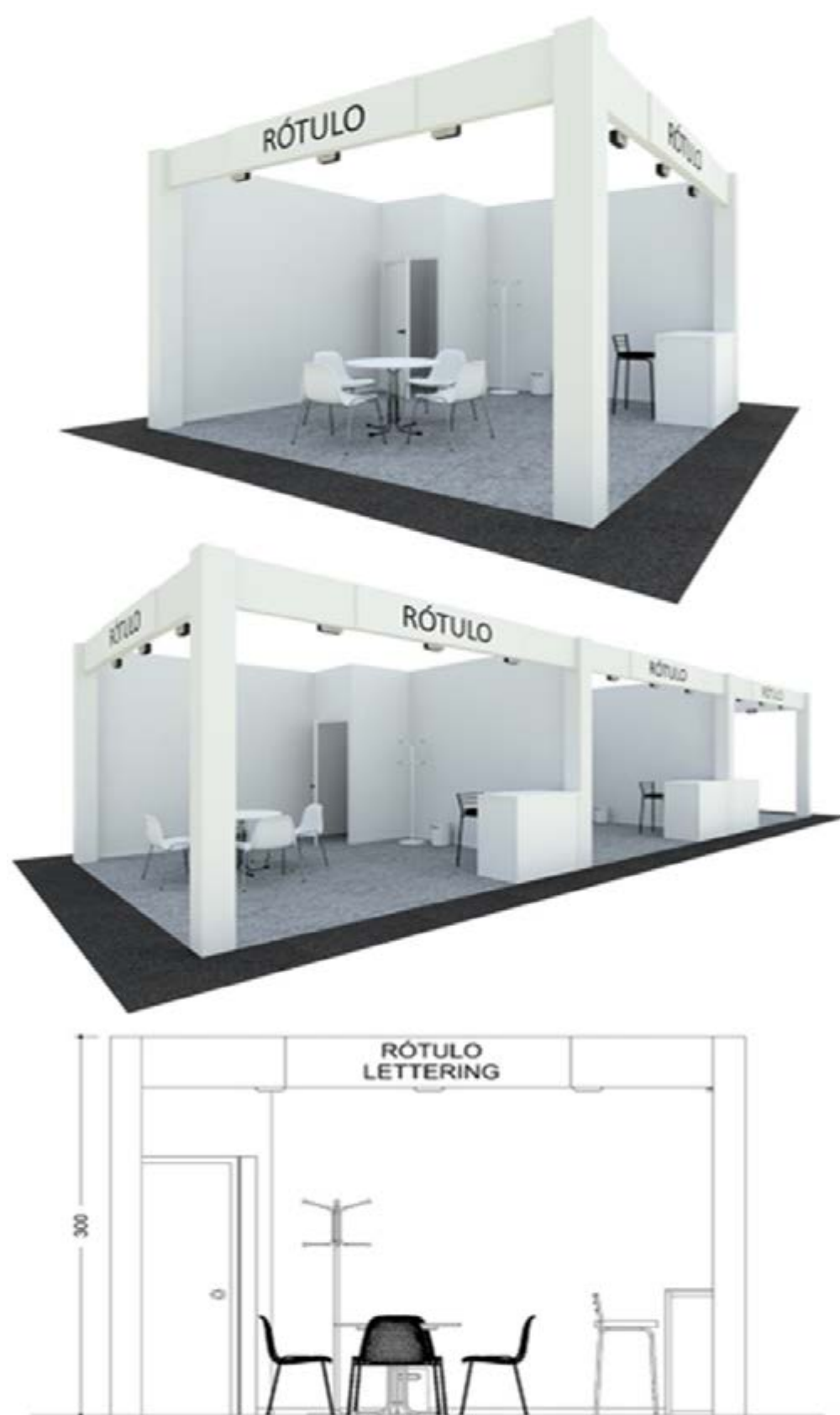
Turnkey stand "all inclusive" Modular PREMIUM

GUIDING DRAWING: It is not allowed to pierce or nail elements to the stand. It is possible to use adhesive tape or graphics, which are easily removable and do not damage the panels.