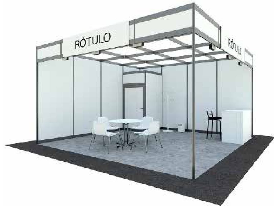
Turnkey "all-inclusive" stand Modular BASIC