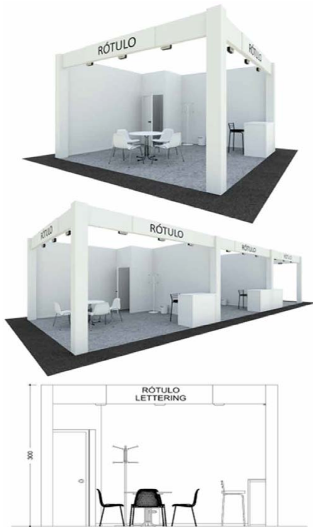
Turnkey stand "all inclusive" Modular PREMIUM

GUIDING DRAWING: It is not allowed to pierce or nail elements to the stand. It is possible to use adhesive tape or graphics, which are easily removable and do not damage the panels.