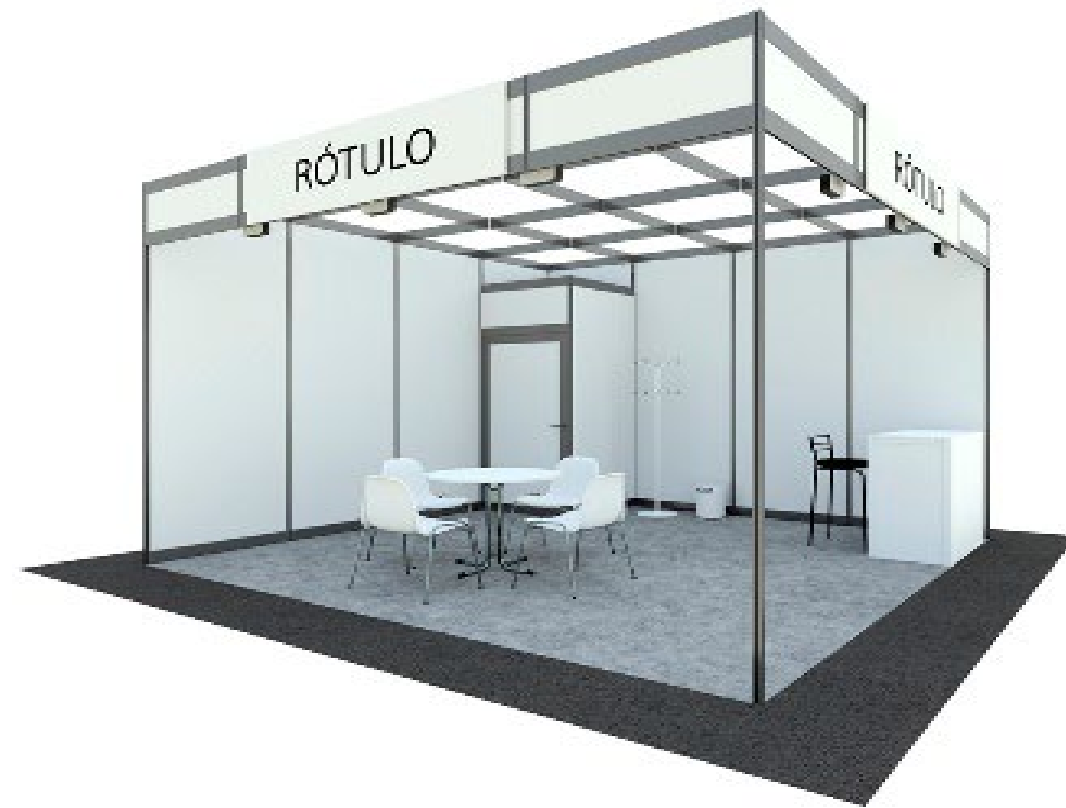
Turnkey "all-inclusive" stand Modular BASIC